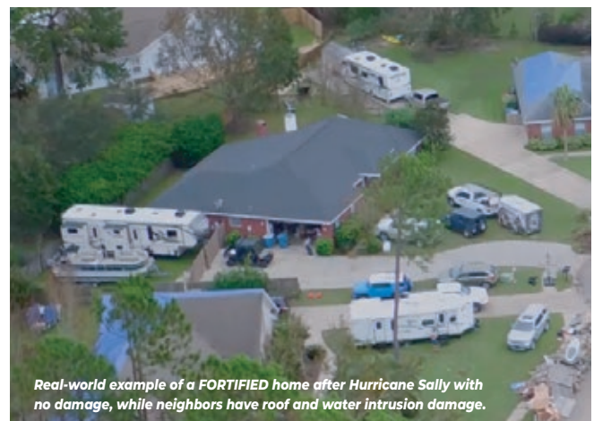
Real-world example of a FORTIFIED home after Hurricane Sally with no damage, while neighbors have roof and water intrusion damage.